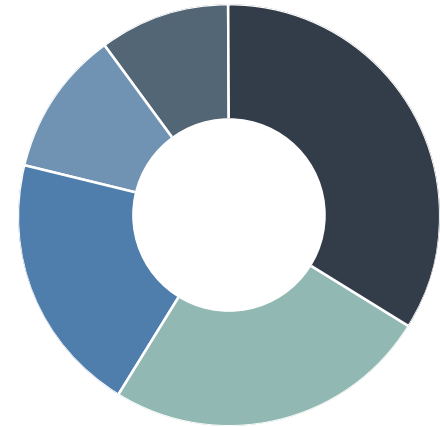
Geographic spread by value