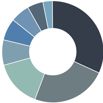
Hg 'cluster' by value

HgT provides exposure to a portfolio of 50 software and services businesses, with diversification across markets, vintages and geographies.